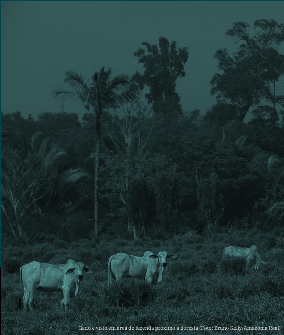
Gado e visto em área de fazenda próximo a floresta

Economic drivers in the Amazon from the 19th century to the 1970s