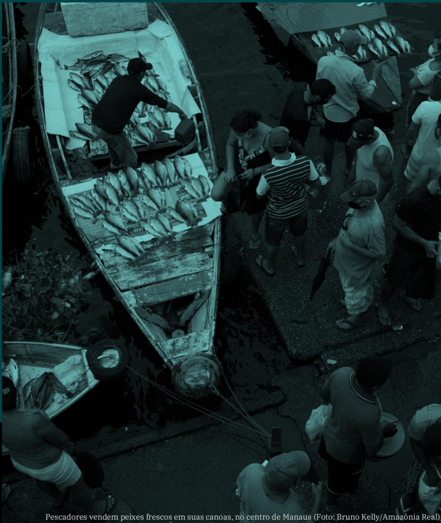
Pescadores vendem peixes frescos em suas canoas, no centro de Manaus

Drivers and impacts of changes in aquatic ecosystems