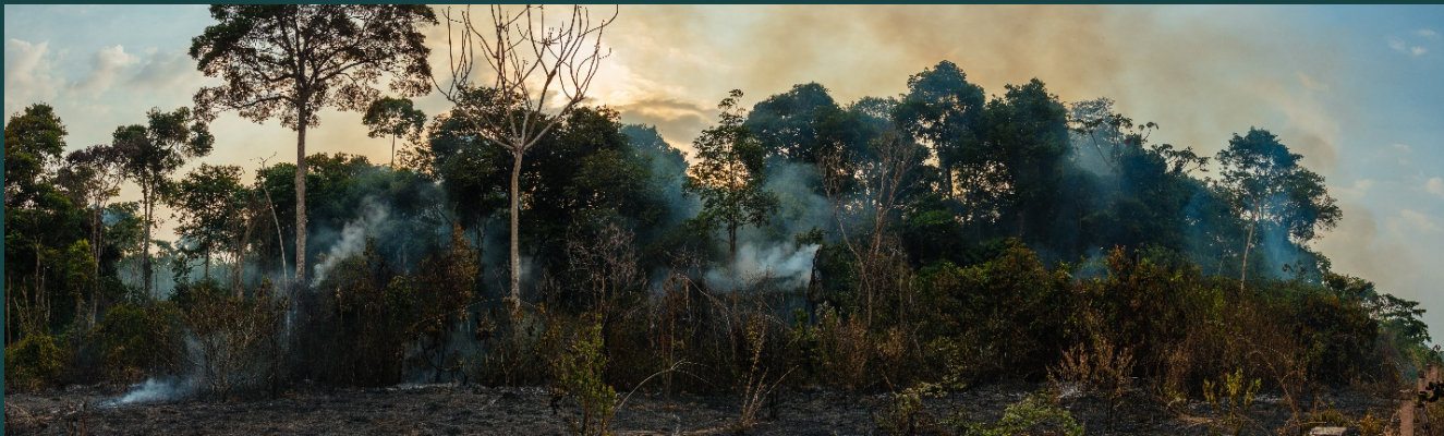
Figure B.28.1 Degraded forests in the central Amazon.