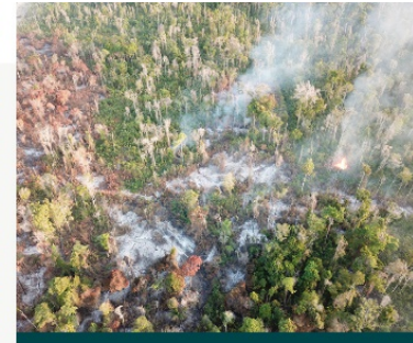
Avoiding further degradation