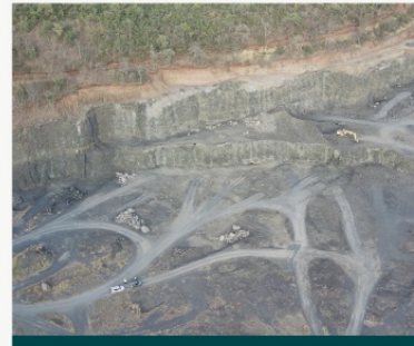
Rehabilitation after mining