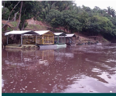
Remediation of pollution