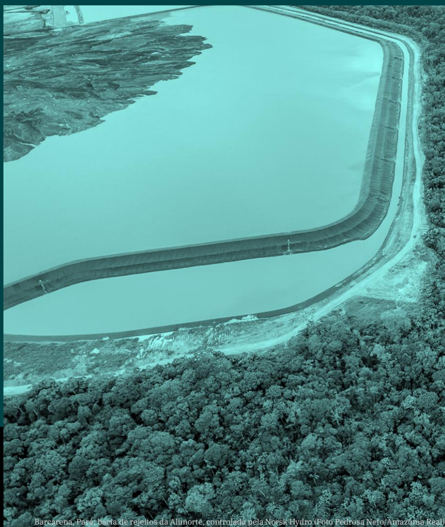
Barcarena. Para-bacia de rejeitos da Alunorte, controlada pela Norsk Hydro