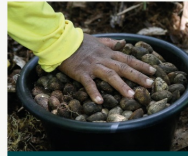
Restoration of economic activities